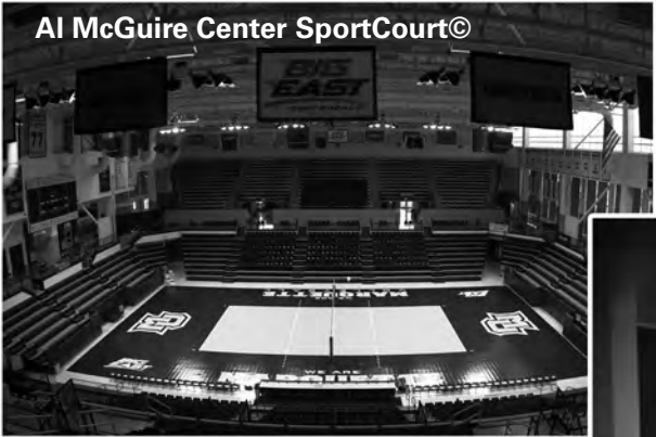
Al McGuire Center SportCourt©