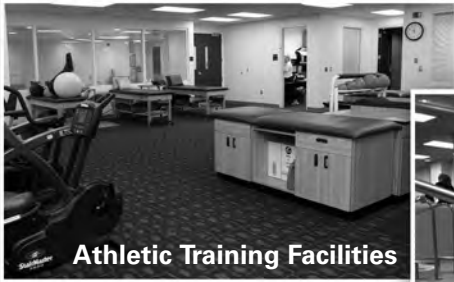
Athletic Training Facilities