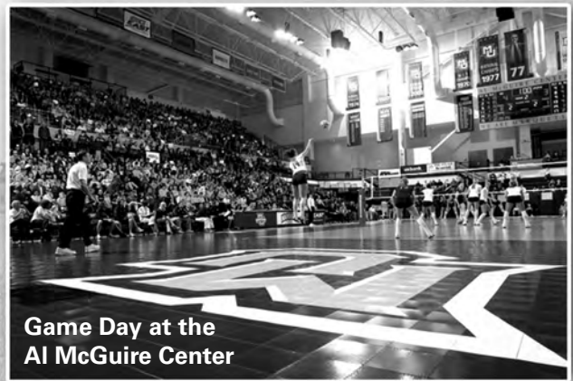
Game Day at the Al McGuire Center

Marquette University provides its student-athletes the opportunity to train in one of the nation's elite practice facilities - The Al McGuire Center.