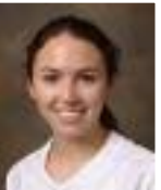
24 Katie D Miller