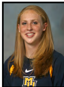
Freshman Forward 6-3 Dixon, Ill. Newman Central Catholic