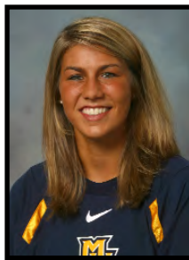
Freshman Forward 6-0 Johnsburg, Ill. Johnsburg