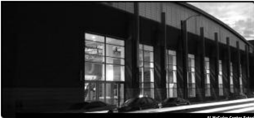
Al McGuire Center Exterior