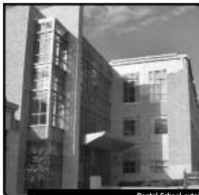
Dental School exterior

Whether it's preparing students for their first job or putting graduate and professional students on the road to even greater professional success and achievement, Marquette's academic programs have what it takes. They're delivered by faculty scholars at the tops of their fields and respected for funded research in areas ranging from the humanities to the sciences.