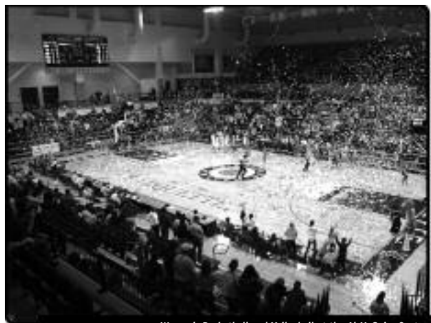
Women's Basketball and Volleyball at the Al McGuire Center