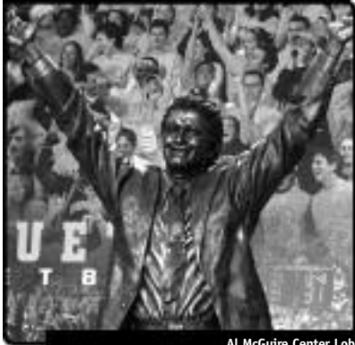
Al McGuire Center Lobby