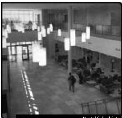
Dental School interior