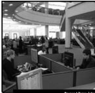
Raynor Library interior