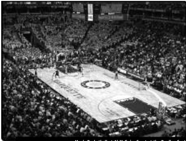
Men's Basketball at Al McGuire Court at the Bradley Center

Marquette University offers its student-athletes the finest in athletic facilities. The 14 athletic teams that represent the university train, strengthen and get treatment at the Marquette Gym on campus. The MU Gym also serves as home for many of Marquette's sports.