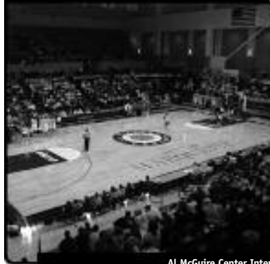
Al McGuire Center Interior