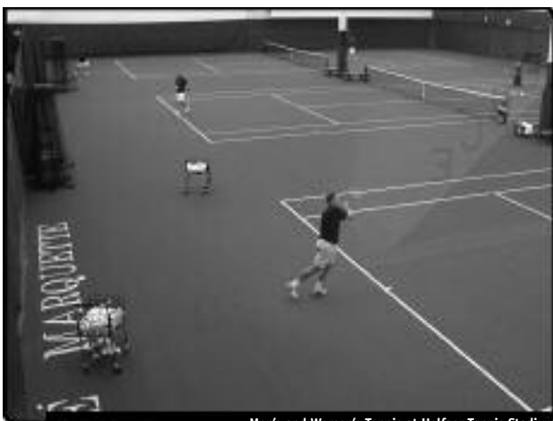
Men's and Women's Tennis at Helfaer Tennis Stadium