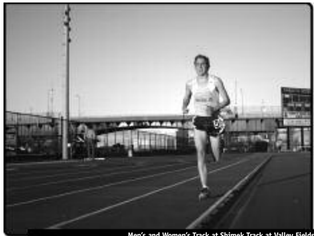
Men's and Women's Track at Shimek Track at Valley Fields