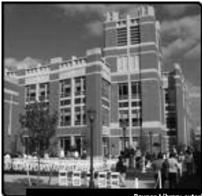
Raynor Library exterior