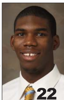
Fr. | 6-6 | 210 | Forward Atlanta, GA Montverde Academy