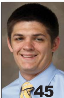
Sr. | 6-1 | 190 | Guard Sherwood, WI St. Mary Central HS