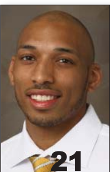
Sr. | 6-7 | 205 | Forward Plano, TX Plano HS/Tyler JC