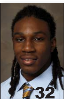
Jr. | 6-6 | 225 | Forward Villa Rica, GA Villa Rica HS/Howard CC