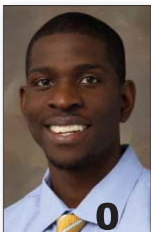
So. | 6-7 | 210 | Forward Racine, WI Horlick HS/Oregon