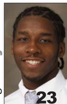
Sr. | 6-3 | 190 | Guard Milwaukee, WI Bay View HS/Indian Hills JC