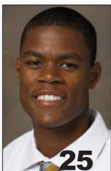
Jr. | 6-4 | 190 | Guard Coatesville, PA Hill School/High Point