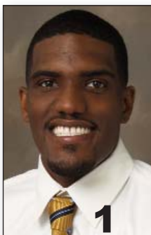
Jr. | 6-2 | 215 | Guard Raleigh, NC Wakefield HS/Hutchinson CC