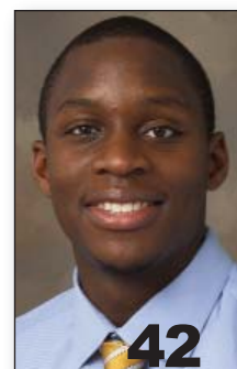
So. | 6-11 | 260 | Center Richmond, TX Ft. Bend Bush HS