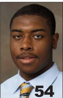
Fr. | 6-8 | 290 | Forward Suffolk, VA King's Fork HS