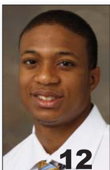
So. | 6-7 | 210 | Forward Houston, TX Cypress Springs HS