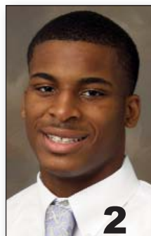
Fr. | 6-4 | 190 | Guard Madison, WI Memorial HS