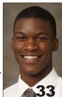
Sr. | 6-7 | 220 | Forward Tomball, TX Tomball HS/Tyler JC