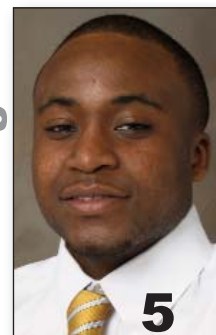
So. | 6-1 | 205 | Guard Toronto, Ontario Christian Life Center Academy