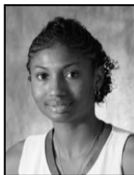
Angel McCoughtry BIG EAST 2007 Player of the Year 2007