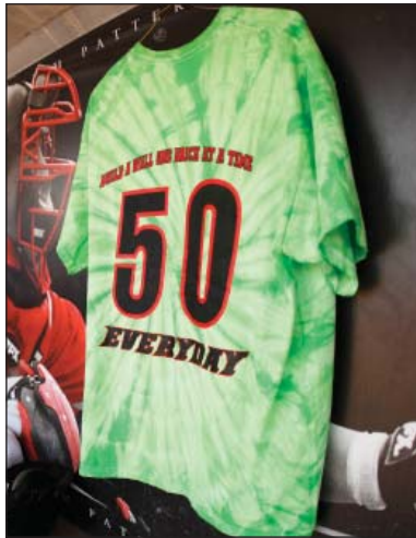
The No. 50 shirt above was the final shirt awarded in the Cardinals' 2010 season, which ended with a school record 50 wins. The photo was taken prior to Louisville's NCAA Regional win over Vanderbilt at Jim Patterson Stadium.