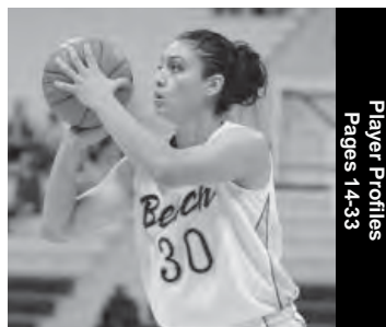
Player Profiles Pages 14-33