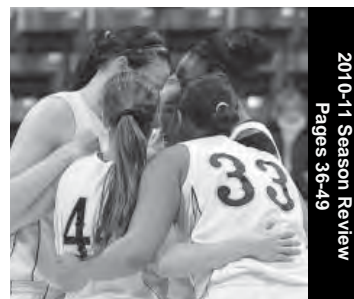
2010-11 Season Review Pages 36-49