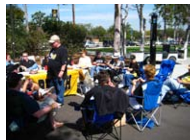
Men's Basketball Support Group

Homecoming is a tradition that will celebrate its 60th Anniversary on Saturday, November 22, 2008 this coming fall. Save-the-date!