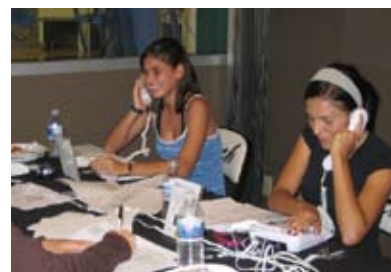
Women's Soccer during the Phone-A-Thon

of our former athletes, but the support was an indication that we are well on our way to bringing them back into the Athletics family.”