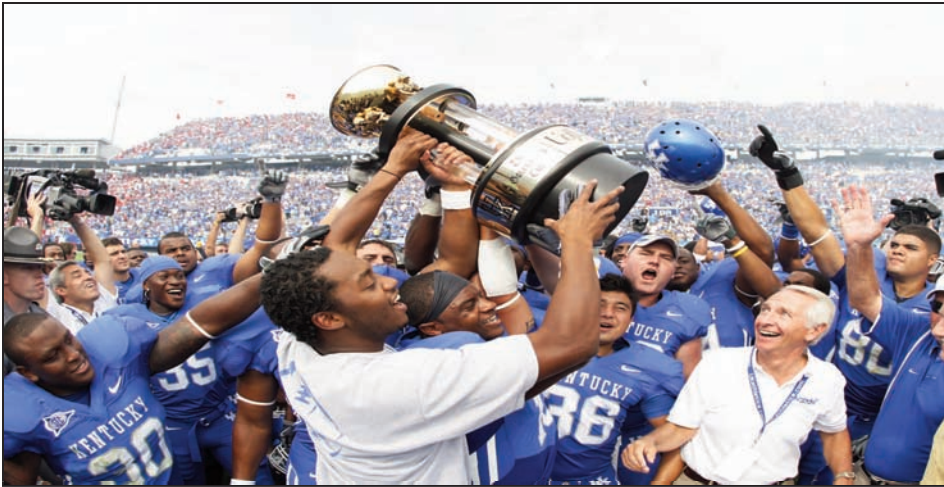
Kentucky has won three consecutive games in the Governor's Cup race, including 31-27 last season.