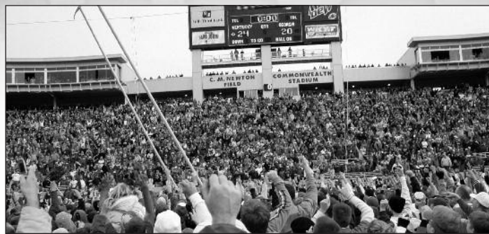
Fans tore down the Commonwealth Stadium goalposts twice, following the 1997 win over Alabama and the 2006 victory (shown here) vs. Georgia.