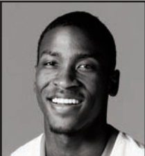
Michael Kidd- Gilchrist 14

6-7 • 232 • Fr. Somerdale, N.J. (St. Patrick)