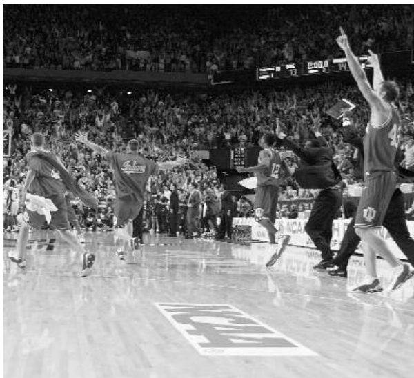
Indiana upset Duke in the 2002 South Regional in Lexington.