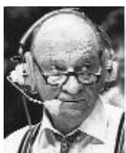
Cawood Ledford "Voice of the Wildcats" 1953-92