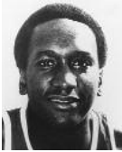
21 - Jack Givens 1975-76-77-78