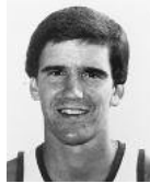
4 - Kyle Macy 1978-79-80