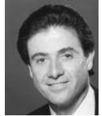
Rick Pitino Head Coach - 1990-97

★Member of "The Fabulous Five," 1948 National Champions & Olympic Gold Medalists *Member of 1954 Undefeated National Champions