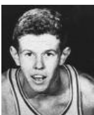
*30 - Frank Ramsey 1951-52-54