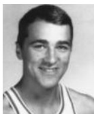
10 - Louie Dampier 1965-66-67