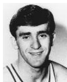
42 - Pat Riley 1965-66-67