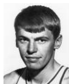
44 - Dan Issel 1968-69-70 UK's All-Time Leading Scorer