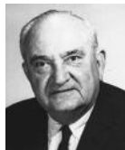
Adolph Rupp Head Coach - 1931-72