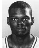
24 - Jamal Mashburn 1991-92-93