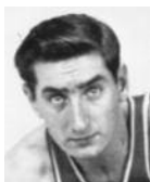
*15 - Alex Groza 1945-47-48-49