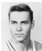
*6 - Cliff Hagan 1951-52-54