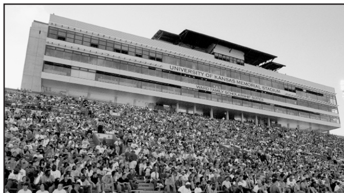
The Memorial Stadium pressbox contains 36 scholarship suites on two floors and more than 130 seats for members of the media on the main press level.

Photo vests are available for accredited news media. Photographers may work from the sidelines in accordance with NCAA rules. The bench area is off limits to the media and to those taking photographs. Photographers must secure a sideline vest from a representative of the media relations office to have field access. The vests can be picked up in the press box. No sideline credentials will be issued to freelance photographers or radio station representatives except for the two originating networks.