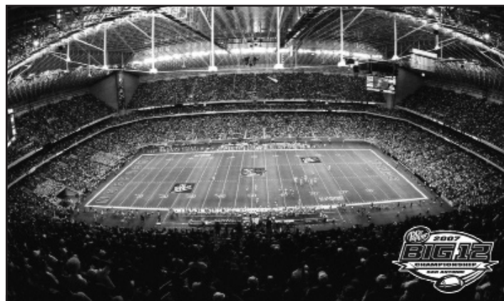
The 2007 Dr. Pepper Big 12 Championship football game will played in San Antonio, Texas at the Alamodome.

The Big 12 staff administers to over 4,600 student-athletes in 21 sports. The conference is headquartered in Irving, Texas.