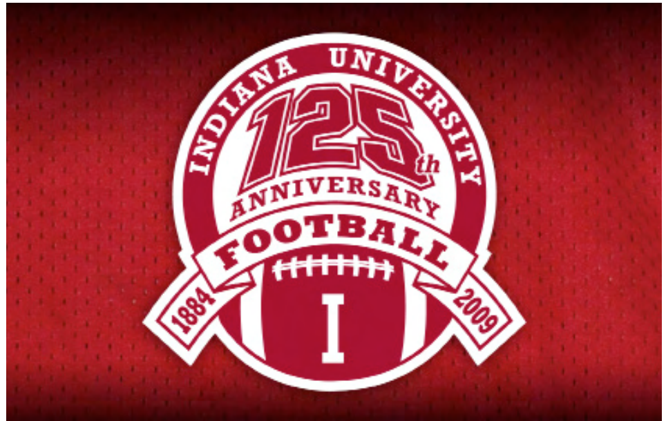
The Hoosiers will wear this patch on their uniforms this season to celebrate the 125th year of Indiana University Football.

Through the first quarter of the season the Indiana defense has made significant strides from 2008 and ranks in the top four in the Big Ten in six defensive categories. The Hoosiers share the league lead in turnover margin (+3), rank second in rushing defense (76.0), sacks (9) and opponent third down conversion (29.4), and rank fourth in scoring defense (17.7) and total defense (312.3).