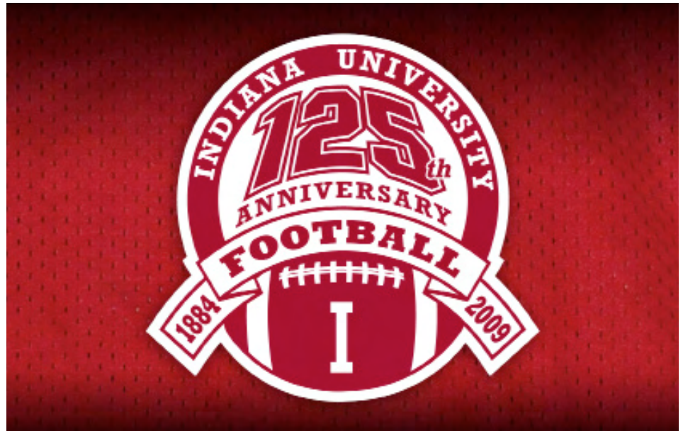
The Hoosiers will wear this patch on their uniforms this season to celebrate the 125th year of Indiana University Football.