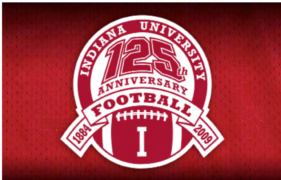
The Hoosiers will wear this patch on their uniforms this season to celebrate the 125th year of Indiana University Football.