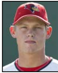
Duffy Bass Endowed Scholarship

Established by the family and friends of a deceased, loyal Redbird fan.