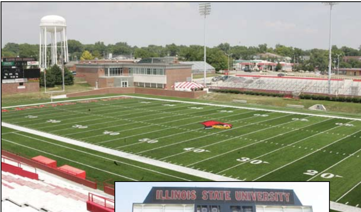
Above: A view of the new playing surface and the stone-capped brick wall in the northeast corner of Hancock Stadium. Right: The scoreboard in the north end zone is dismantled to install the new video board.