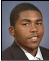
Doug Collins Endowed Scholarship

Named for the 1930s-era athlete who helped establish the Redbird golf program.