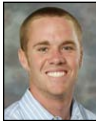
D.A. Weibring Endowed Scholarship

Named in honor of the long-time Redbird basketball supporters.