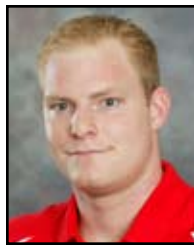
W.F. Ruebush Endowed Scholarship

Named for the Redbird basketball coach who helped pioneer sports opportunities for women.