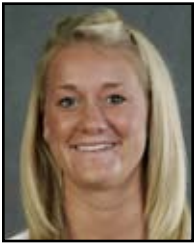
Bob & Audrey Weber Endowed Scholarship

Named for the pioneering African-American basketball coach and NBA administrator for seven decades.