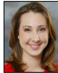
Linda Herman Endowed Scholarship

Named for the 1930s-era athlete who helped establish tennis as an ISU sport.