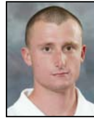
L. Durwood Boone Endowed Scholarship

Named for the winningest Redbird baseball coach in history, who led the 1969 Illinois State baseball team to its only team NCAA championship.