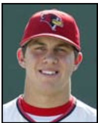
Fairchild Award Endowed Scholarship