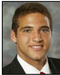
Benoni Green Endowed Scholarship