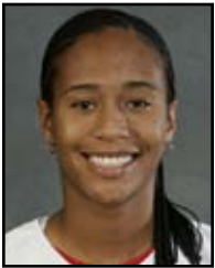
Jill Hutchison Endowed Scholarship