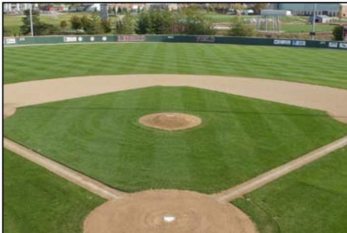
Illinois State's baseball field will be renamed Duffy Bass Field.

"In the 150-year history of Illinois State, there have been a few individuals who have distinguished themselves as student-athletes, not just during their time at Illinois State, but in