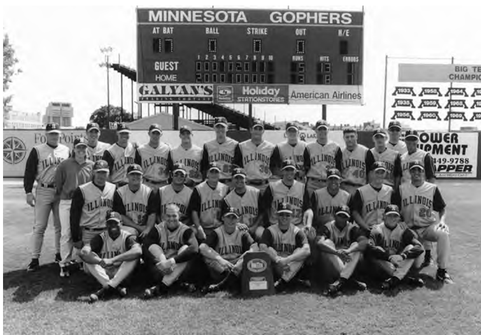
Illinois got five straight complete-game outings from its starting pitchers to help bring home the Big Ten Tournament championship in 2000.