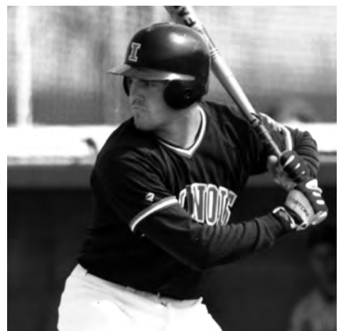
Scott Spiezio was named to four All-America teams in 1991 and 1993 combined.