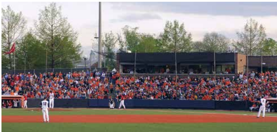
The 2009 Bleacher Bum Barbecue broke the school attendance record with 5,214 fans.