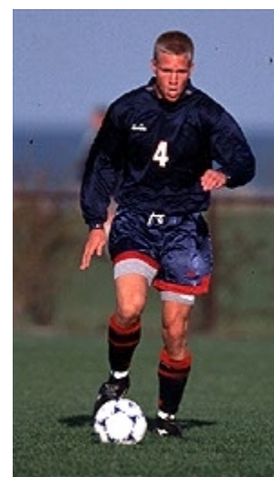
Jay DeMerit was a three-time first team all-league selection during his career at UIC.