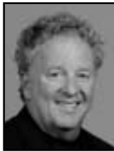
TOM PENDERS Men's Basketball