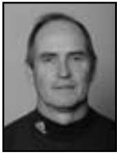
ART BRILES Football