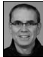
BILL WALTON Volleyball