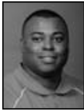
LEROY BURRELL Track & Field