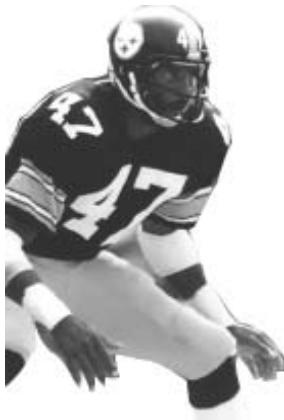
Mel Blount Pittsburgh Steelers Hall of Fame Inductee, Class of 1989