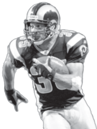
Aeneas Williams Arizona Cardinals, St. Louis Rams