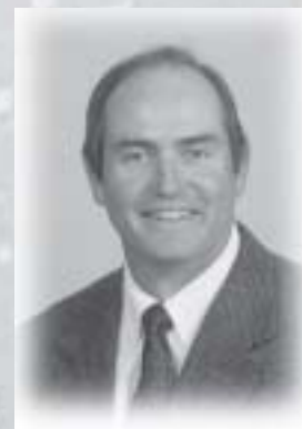
Art Briles Head Football Coach