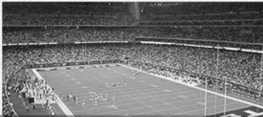
Several professional sports teams call Houston home, including the Astros (baseball), Texans (football) Rockets and Comets (basketball) and Aeros (minor league hockey).