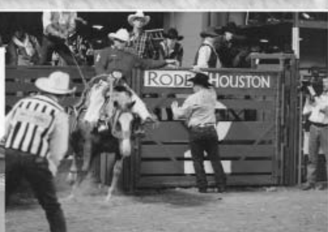
Houston is home to the annual Houston Livestock Show and Rodeo, the world's largest rodeo.