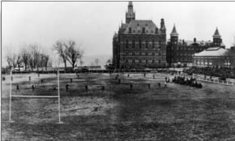
November 30, 1916: Georgetown 47, George Washington 7

Georgetown faces Mississippi State in the Orange Bowl. The Bulldogs defeat the Hoyas by a score of 14-7.