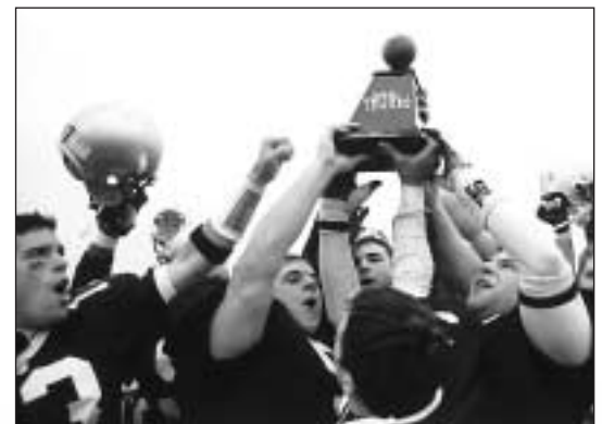
1997 - Georgetown: Crowned MAAC League champions after finishing 7-0 in league competition.