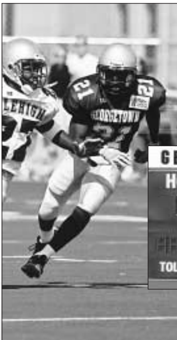
September 1, 2001: GU's first game in the Patriot League vs. Lehigh.

Patriot League football on Georgetown's campus begins.