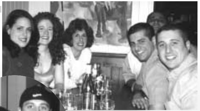
The Eacobacci family