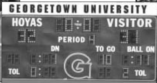
October 26, 2002: Georgetown defeats Bucknell 32-31.