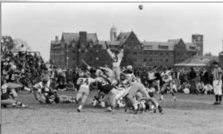
November 1971: Georgetown 30, Fordham 9

The Hoyas announce they accept an invitation to join the prestigious Patriot Football League. GU plays an independent schedule.