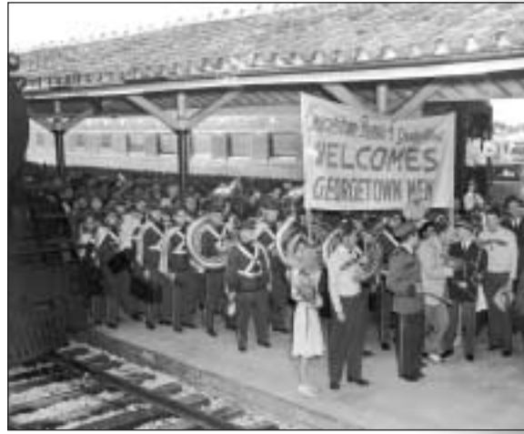
1941 Orange Bowl: Hoya faithful await Georgetown's arrival in Miami.