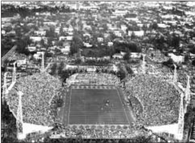
Georgetown vs. Mississippi State at the 1941 Orange Bowl.