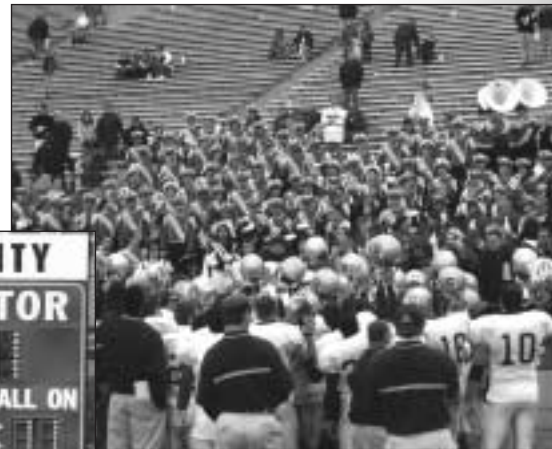
October 18, 2003: Georgetown celebrates its 42-20 victory at Cornell.

Georgetown faces its first Ivy League opponent since 1937 and defeats Cornell 42-20.