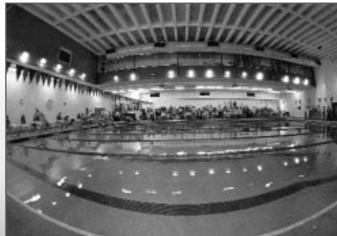
Smith Center Pool — Home of GW Swimming and Diving