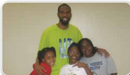
• Hanging out with Richard "Rip" Hamilton (Detroit Pistons)