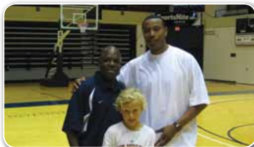
• Posing for a picture with Karl Hobbs and Caron Butler