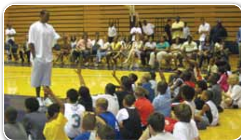
• Learning from the best with Caron Butler (Washington Wizards)