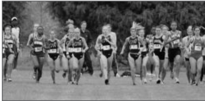
A strong group of returners should offset the loss of five seniors for the 2006 women's team.