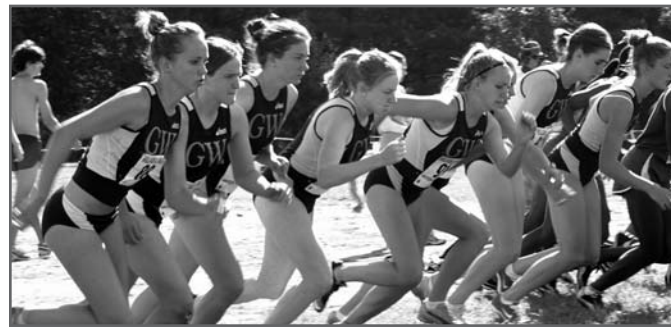
The GW women's team will definitely be a force to be reckoned with in the A-10 in 2007.