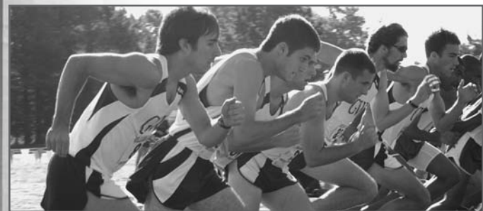
A solid class of returnees and newcomers will certainly move the Colonials up the ranks in the Atlantic 10.