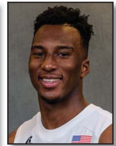
Josh Okogie 5 G • 6-4 • Fr.