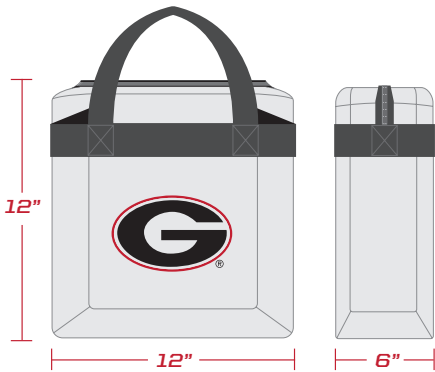
CLEAR TOTE: Plastic, vinyl or PVC and may not exceed 12" x 6" x 12"