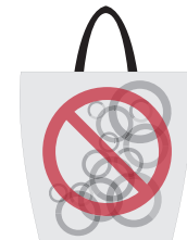
Non-Clear/Printed Pattern Tote

A COMPLETE LIST OF PROHIBITED ITEMS IS AVAILABLE AT: