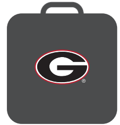
SEAT CUSHION/BACK: No bigger than 16" and no arms or pockets