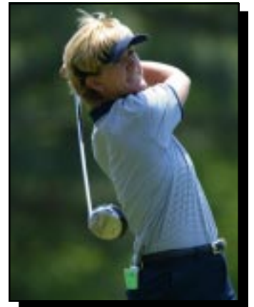
Beth Daniel LPGA Hall-of-Fame, 32 Career Victories