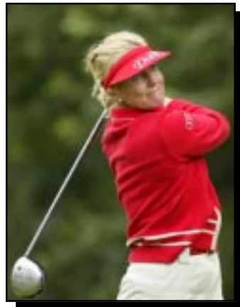
Betsy King LPGA Hall-of-Fame, 34 Career Victories