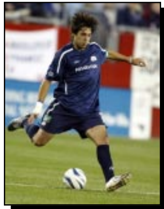
Clint Dempsey New England Revolution