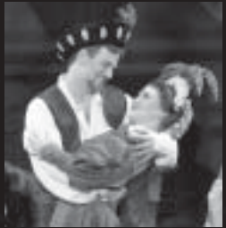
"Kiss Me Kate"

It is easy to understand why over one million people a year flock to the Tallahassee-Leon County Civic Center, what with the varied array of attractions it offers. Some people go to the Civic Center to enjoy the sounds of rock, country, pop and urban concerts. Some go for the thrills of basketball, rodeos and threering spectaculars. While others come for