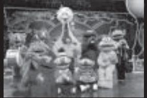
"Sesame Street Live"