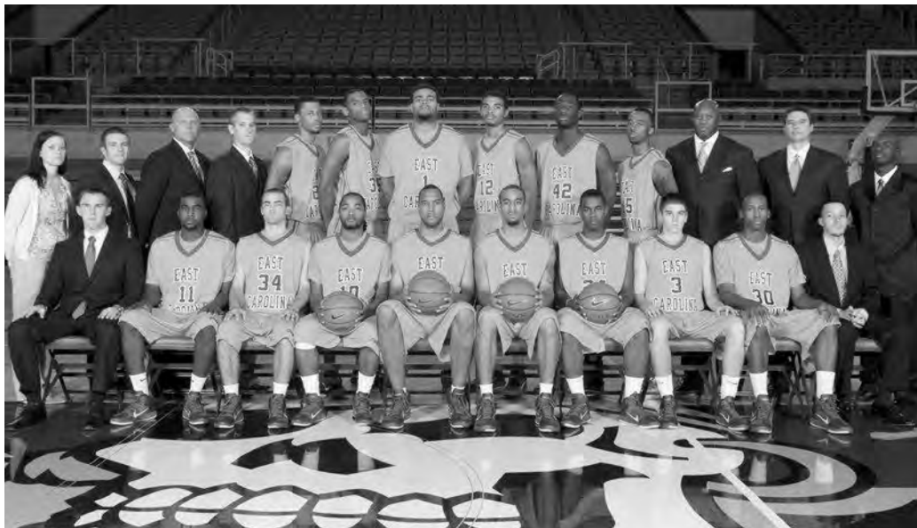
The 2010-11 Pirates recorded the program's first winning season since 1996-97.