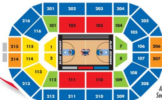
Allstate Arena Seating Diagram