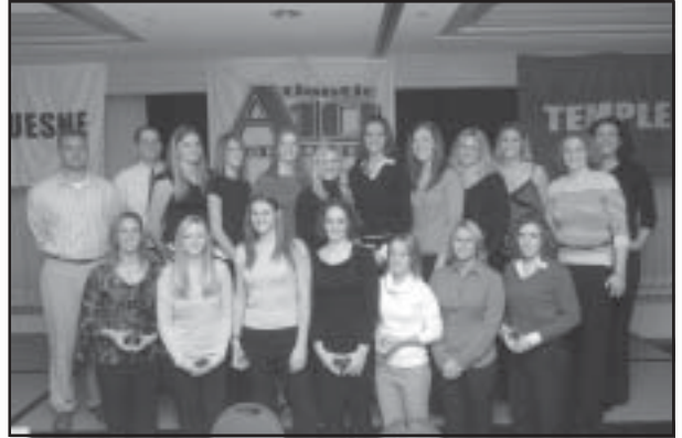
Dayton won the Atlantic 10 Regular Season Championship for the third time in school history in 2004. The Flyers also took the crown in 1998 and 2001.