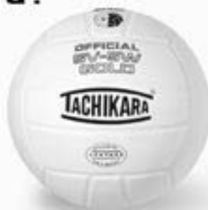
SV-SW GOLD® Premium Leather Volleyball COLOR: (White)