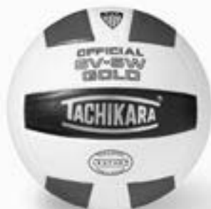
SV-SW GOLD® Premium Leather Volleyball COLOR: (Scarlet / White / Navy)