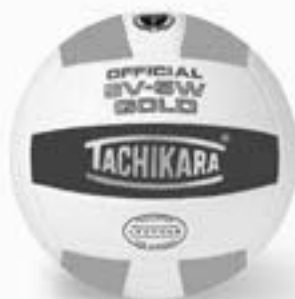
SV-SW GOLD® Premium Leather Volleyball COLOR: (College Blue / White / Silver Gray)