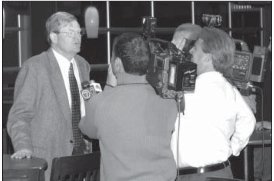
The Flyers' 2004 season received a wealth of local and national media attention. Here, Coach Tucker address the media following the NCAA Selection Show.