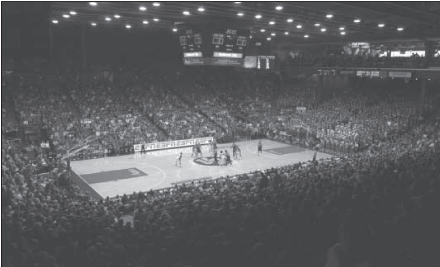
A sold-out UD Arena crowd of 13,409 watches the tipoff of the Dayton-Xavier game on Feb. 19, 2005. Although the Arena opened its doors 36 years ago, one-third of UD's 75 sellouts have come since 1998.