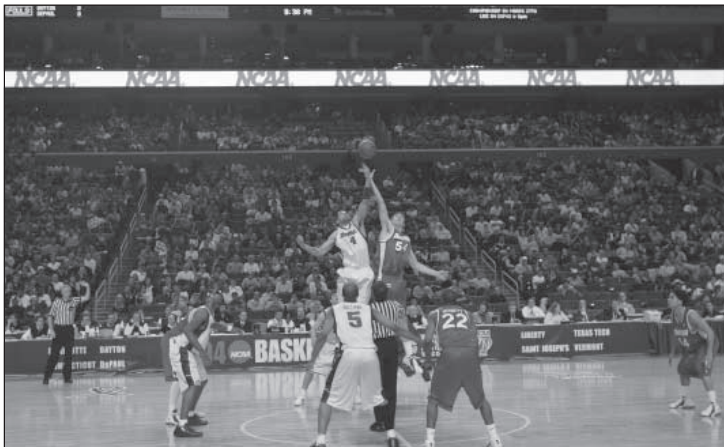
The tipoff between Dayton and DePaul at HSBC Arena in Buffalo, N.Y. during the NCAA Tournament First Round in 2004. The crowd of 18,698 was the 10th-largest to ever watch the Flyers play.