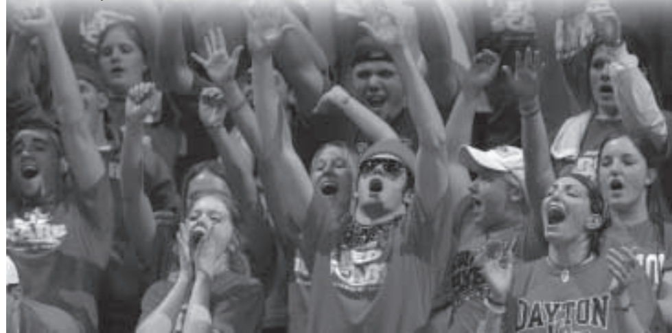
On February 16, 2003, LeBron-mania hit UD Arena, as a sold-out crowd watched future NBA No. 1-pick LeBron James (right) and his St. Vincent-St. Mary's squad take on Alter High School. He returned eight months later with his Cleveland Cavaliers for an NBA Exhibition game.

With the Flyer Faithful, never count on that.