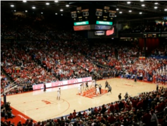
Train on UD Basketball Arena Floor