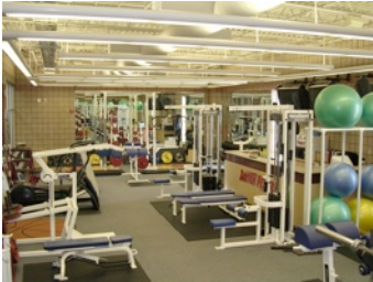
World Class Donoher Weight Room

Campers will utilize some of the finest facilities in the country. Training sessions will be held in UD's nationally renowned University of Dayton Arena, Donoher Center Weight Room and Indoor/Outdoor Track Training Facility.