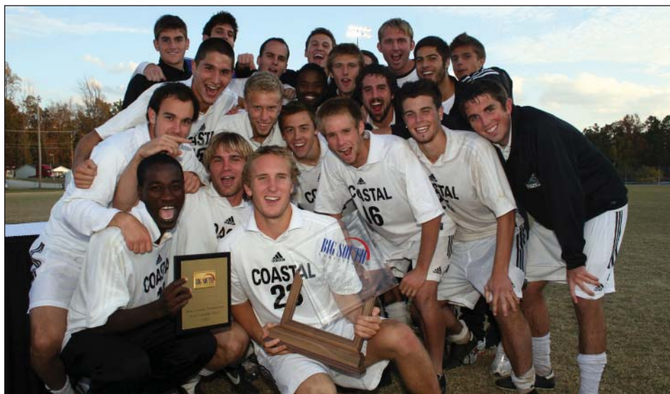
The Chants celebrate after defeating Winthrop in overtime to earn a bid to the 2005 NCAA Tournament.