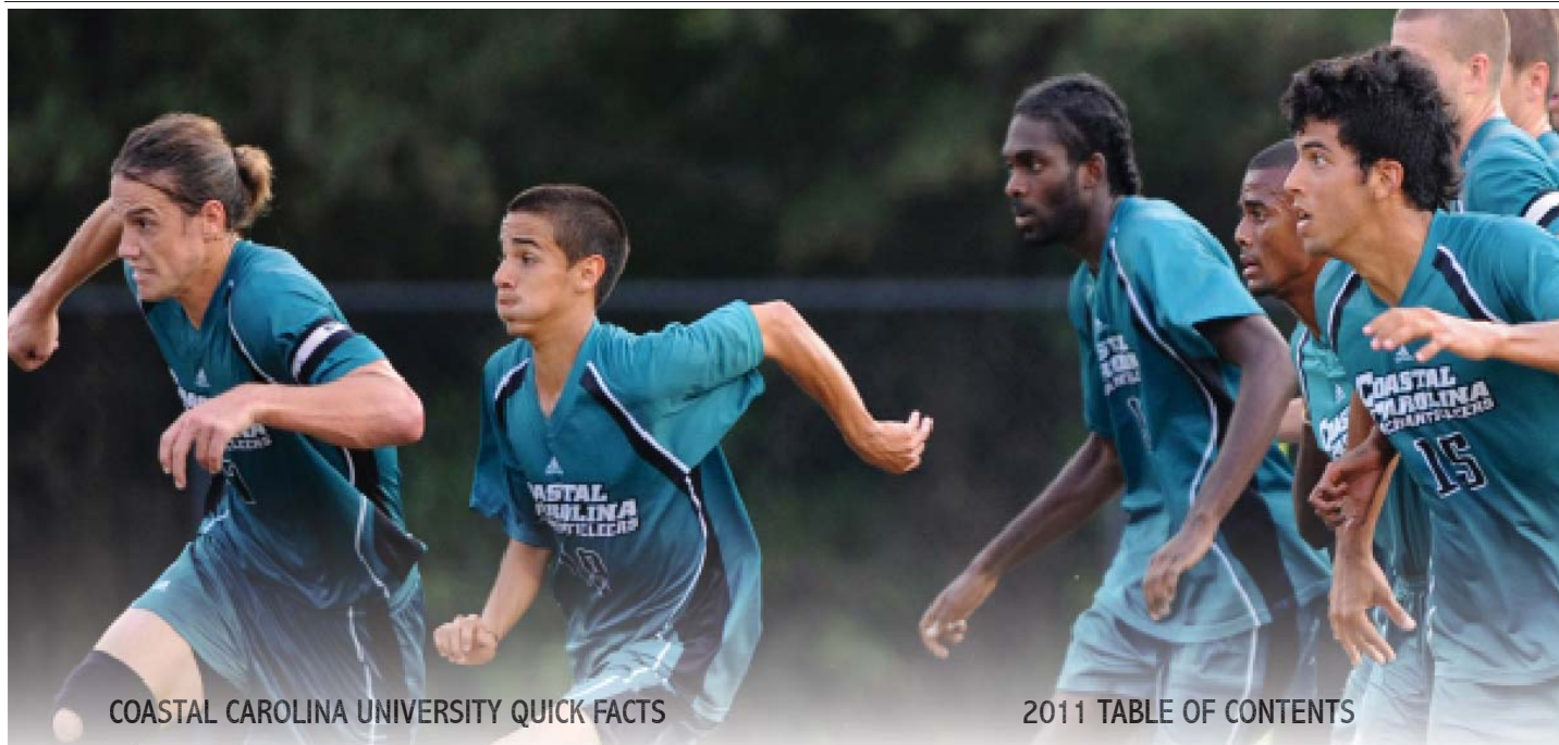
COASTAL CAROLINA UNIVERSITY QUICK FACTS