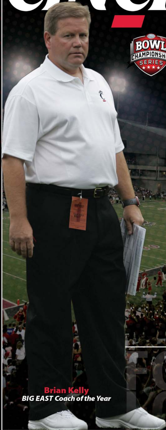
Brian Kelly BIG EAST Coach of the Year