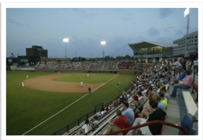
Marge Schott Stadium

Session 4 – August 11 (2010 – 2012 HS grads)