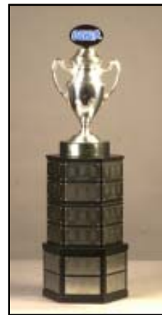
CCHA Regular-Season Trophy