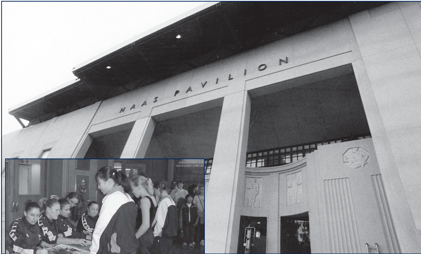
After each home meet, Cal gymnasts sign autographs and meet with fans at Haas Pavilion.

The home of California women's gymnastics is Walter A. Haas Jr. Pavilion - an 11,877-seat, state-of-the-art arena that stands on the same site as beloved Harmon Gymnasium. Renovated from the original structure that was erected in 1933, Haas Pavilion also serves as the home floor of the Golden Bear men's and women's basketball, volleyball and men's gymnastics teams.