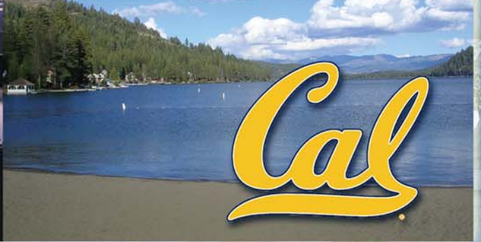
Retreat at Lake Tahoe