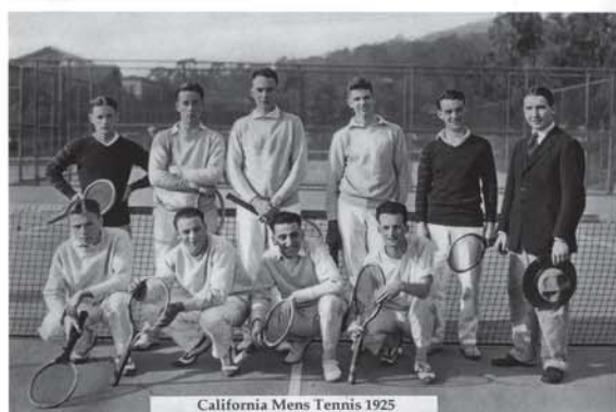
California Mens Tennis 1925

The 1925 team was California's first tennis national champions.