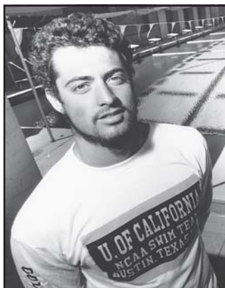
Matt Biondi, inducted into the Cal Hall of Fame in 1997, won eight Olympic gold medals, 12 NCAA titles, and 14 Pac-10 titles.