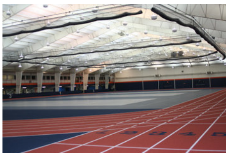
Gerhard Fieldhouse Indoor Track was re-surfaced in August 2007

Distance runners will be taken off campus several times for trail running in scenic RB Winter State Park and the Montour Preserve. R. B. Winter State Park covers 695 acres. Located within Bald Eagle State Forest, it lies in a shallow basin surrounded by rocky ridges covered with an oak and pine forest. The focal point of the park is Halfway Lake which is filled by spring-fed mountain streams and contained by a hand-laid, native sandstone dam.