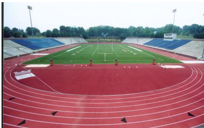
Christy Mathewson Memorial Stadium Home of the Bucknell Bison

A certified athletics trainer will also be on staff for any campers who need medical assistance.